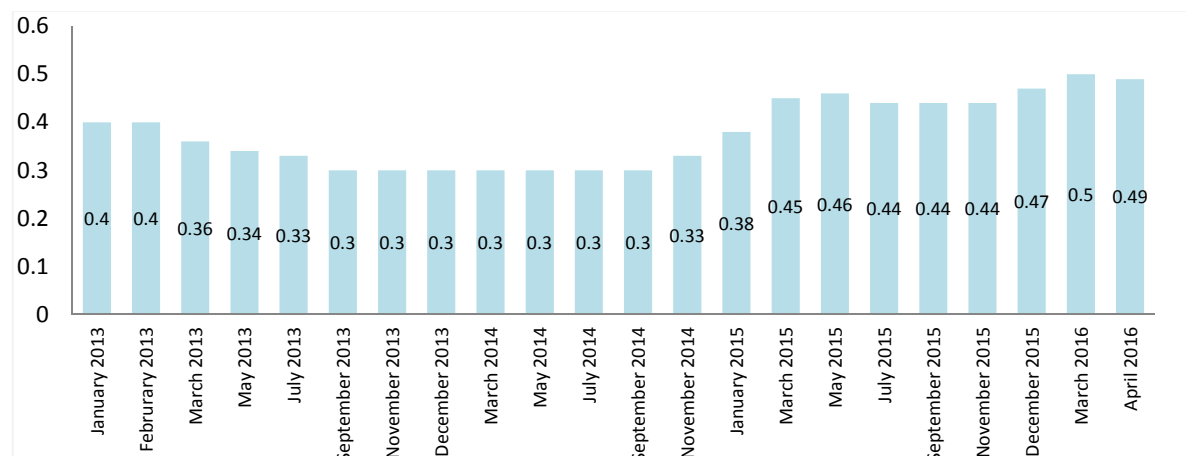
TABLE 5. Consumer price index dynamics in 2015 and January-May 2015, % to the previous month